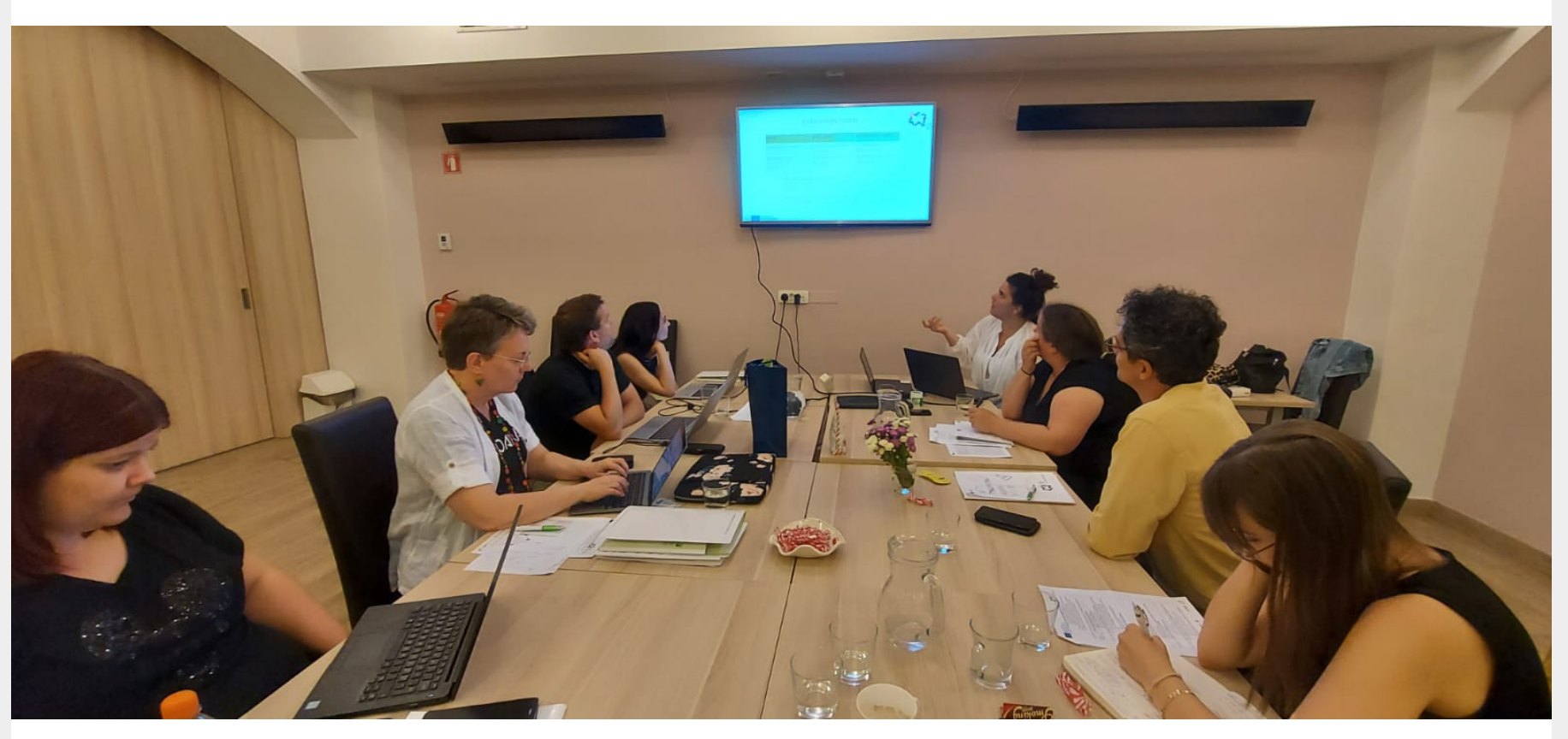
In the picture some of the project partners gathered in Ljubljana, Slovenia, for the fourth transnational meeting June, 2022

Based on this methodology, the project partners are creating activities that successfully combine the teaching of science and the arts.